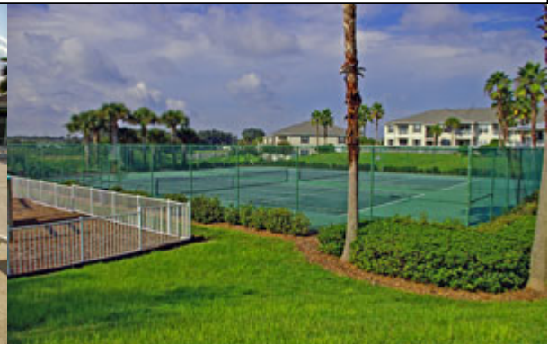
Community swimming pool and tennis courts