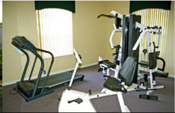
Clubhouse and fitness room